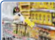
Retailing Voice Picking